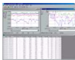
Software for Monitoring and Remote Control